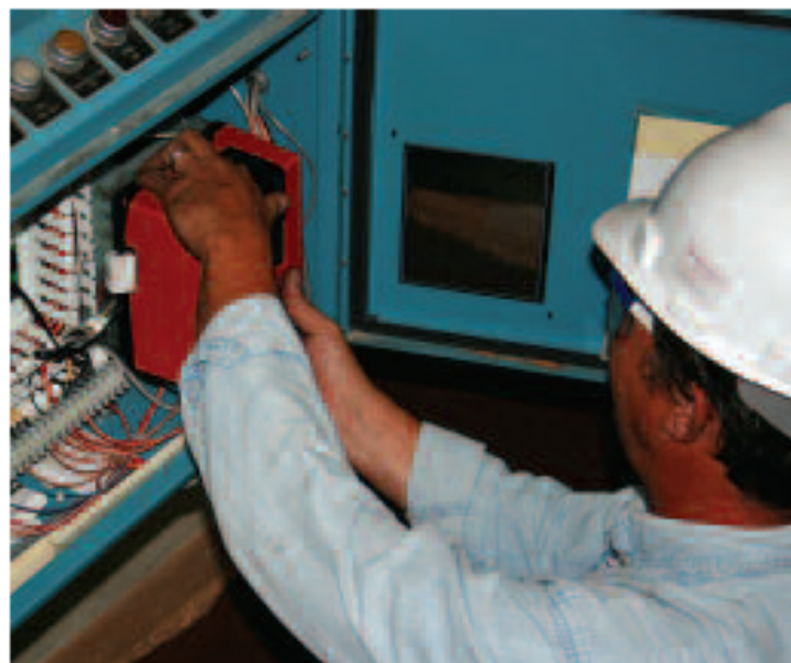
Scheck recently completed work for Wilmette, Ill.-based Advocate Health Care, which features MRI, X-ray, CT scan and other equipment.

units, electric variable air volume boxes, MRI chiller, finned tube radiation, unit heaters, humidifiers and new duct work. "This first-of-its-kind facility will serve as a model for similar imaging centers throughout the world," the company says.